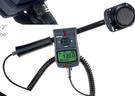
RDS-32 + GMP-25™ Alpha/Beta/Gamma Probe