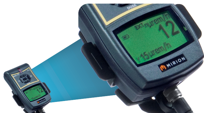
RDS-32iTx + SN-D-2™ Neutron Dose Probe