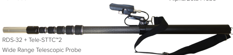
RDS-32 + Tele-STTC™2 Wide Range Telescopic Probe