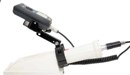
RDS-32 + SAB-100™ Alpha/Beta Probe